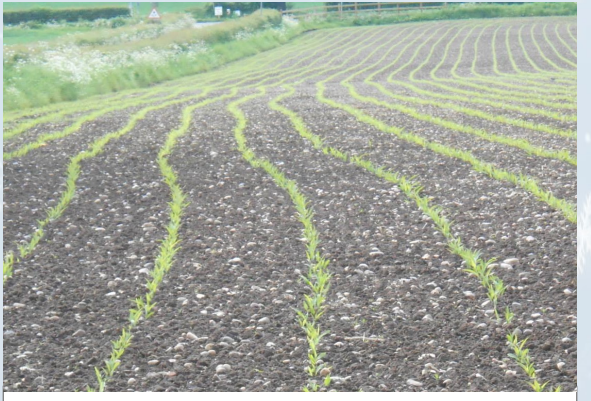
Farm with rocky soil in the United Kingdom

Students will enroll in the full-semester BIOS 2020 Introduction to Environmental Issues class, but the travel itself will occur over Northeast's winter break in March. January and February will be time for students to familiarize themselves with the basics of travel, learn to use the equipment, and become acquainted with each other and their faculty leaders. Upon their return, the rest of the term will be used to analyze their data, rethink their hypotheses, and prepare a formal project based on their experiences.