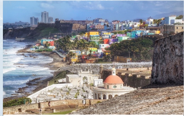
San Juan, Puerto Rico