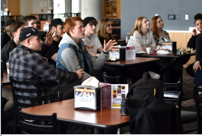
College 360 students are greeted at a Welcome Reception in 2018.

This will be the third year that Northeast has welcomed College 360 students. Northeast and College 360 signed a Memo of Understanding last November, which is a broad-based agreement that not only allows for these types of visits from College 360 students, but also opens the door for a similar visit to College 360 by our Northeast students.